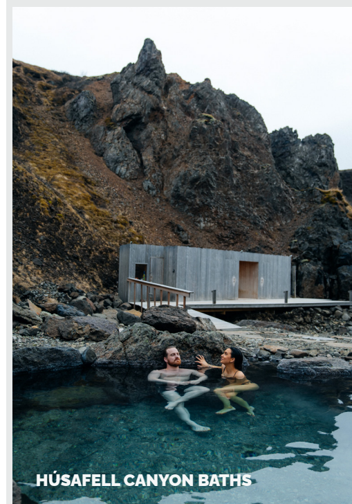
HÚSAFELL CANYON BATHS