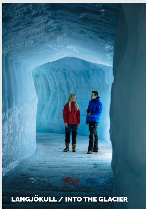
LANGJÖKULL / INTO THE GLACIER