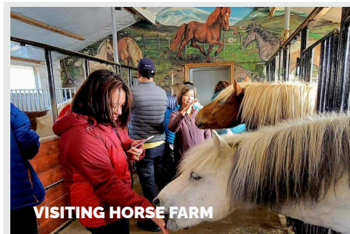
VISITING HORSE FARM